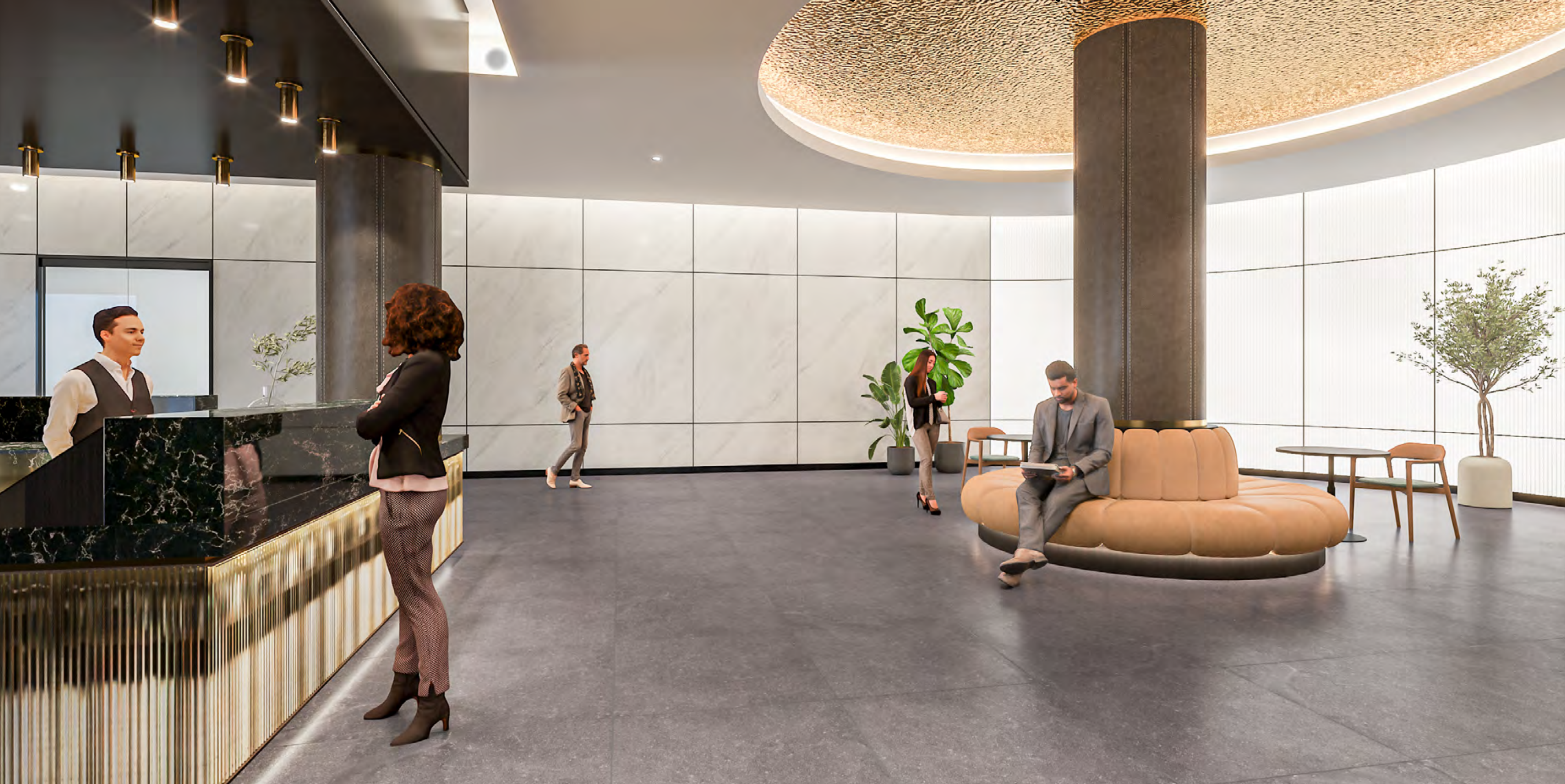
WACKER DRIVE LOBBY SECURITY DESK