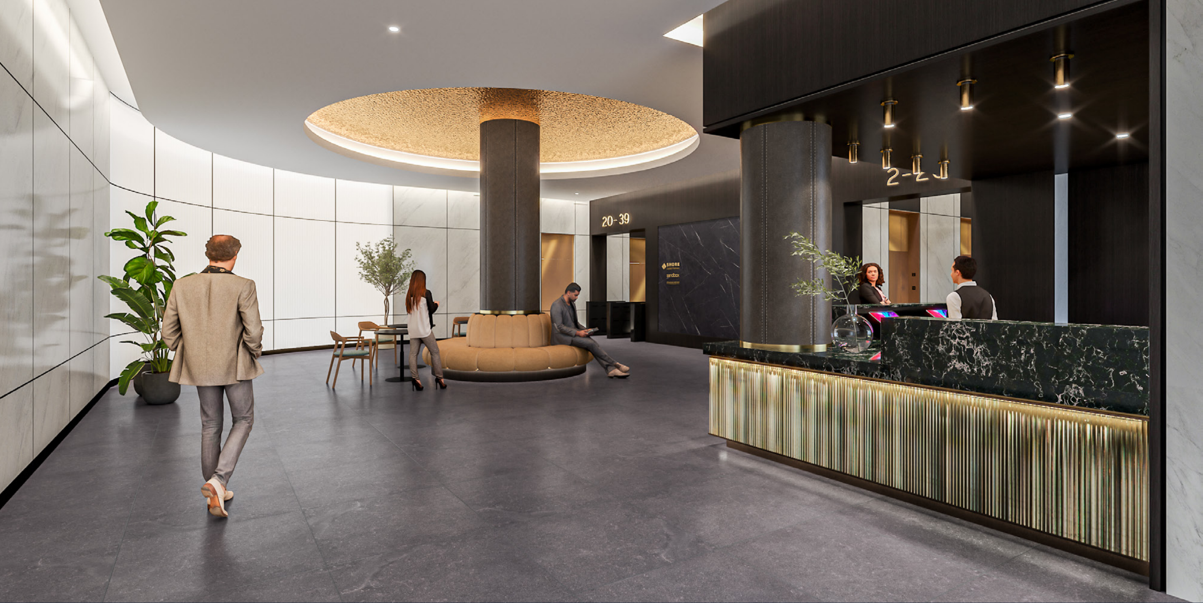
WACKER DRIVE LOBBY